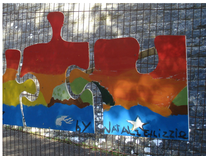
'Designosaur' artwork on display