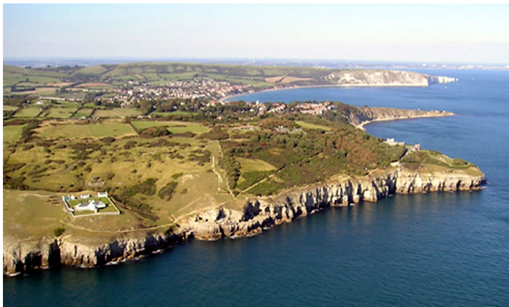
Durlston Country Park in Swanage

Durlston Country Park is a superb outdoor classroom, providing a wealth of opportunities to enhance the study of geography, science, history, art and more.