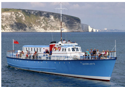
The Western Lady 3

At just £4.50 per student (free to accompanying staff), including work sheets, the trips offer a unique learning experience.